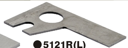
● 5121R(L) 86022 158015199 (86020 158015200)