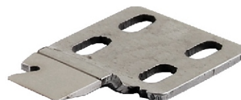
● 5143 R/L