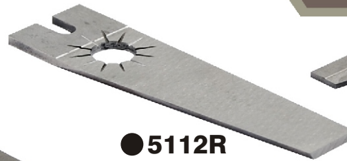
● 5112R 66020 148008744 (5112L) (44) 85035 158018202